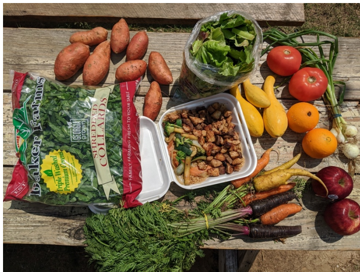
Figure 1: Produce and a hot meal delivered during the pilot Produce Box program Flint River Fresh launched in response to COVID-19. Produce features Georgia Grown and harvests directly from Flint River Fresh community sites.

Albany, Georgia — Flint River Fresh has announced a minimum two week extension to the Produce Box Pilot Program launched April 4 th in response to the COVID-19 Pandemic. The initial 14-day long pilot program was extended after positive feedback and additional support from local businesses.